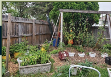
Vegetable/ Herb Garden— Angelica Gallegos