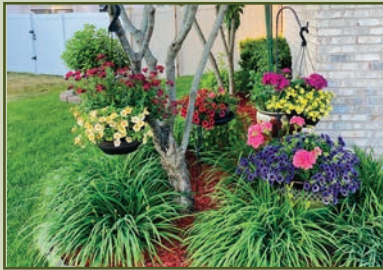
Porch, Balcony or Container Garden— Zofia Konopka

We were very impressed with the quality of gardeners in Streamwood! Judging criteria included: general neatness and appeal, natural or formal layout, use of color, variety of plants, creative use of garden hardware or art, and sustainable features. The Golden Trowels went to: Porch, Balcony or Container Garden — Zofia Konopka; Vegetable/Herb Garden — Angelica Gallegos; Senior Garden — Carole Konetzki; Outdoor Oasis — Maria Wajs; and Shade Garden — Violet Hypta. It is wonderful to see homeowners take such pride in their yards. Neighborhoods are greatly enhanced by greening efforts such as these! Additional photos of each winning garden are posted on our website.