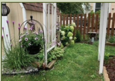
Shade Garden— Violet Hypta