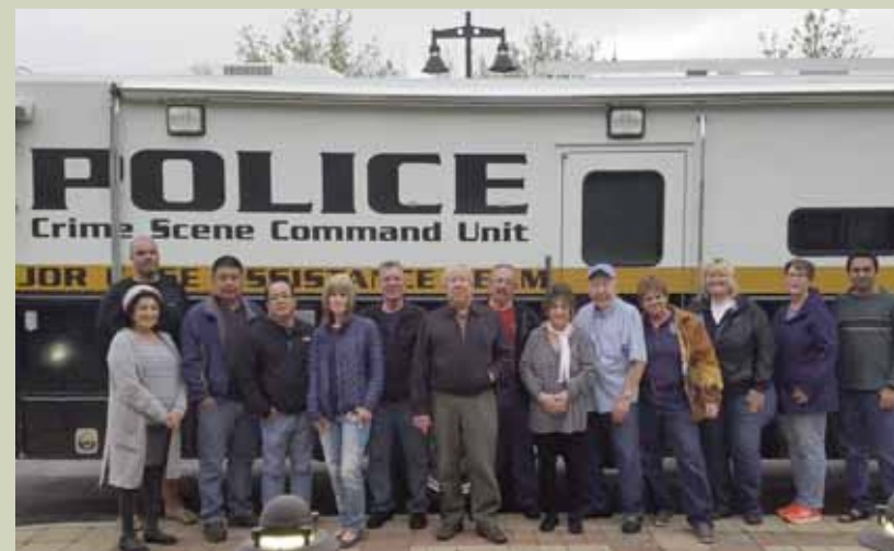
Members of the 2019 Citizens Police Academy Class

Our 2020 Academy will consist of classes that will be held at the Police Department on Monday evenings starting on March 2 through April 27, 2020 from 6:30-8:30 pm. Any citizen working or residing within the Village of Streamwood, who is over 18 years of age, is welcome to apply. Applicants will receive a thorough background investigation, and a class list will be established. Applications are available at Village Hall, the Streamwood Police Department or on the Village website. Application deadline is February 17, 2020.