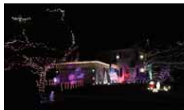
Best Ornamental Display 95 Washington Avenue