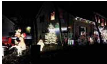
Best Multi-Family Display 1327 Laurel Oaks Court