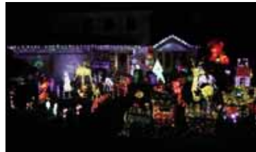
Best Traditional Display 336 Somerset Drive

The Village received quite a number of nominations for best holiday house decorations. The Luminaria Committee had a difficult task, but they were able to choose the winners! The winners are: 95 Washington Ave — Best Ornamental Display; 336 Somerset Dr — Best Traditional Display; and 1327 Laurel Oaks Ct — Best Multi-Family Display. Congratulations!