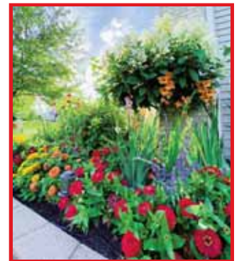
Perennial Garden Zofia Konopka