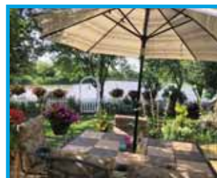
Outdoor Oasis